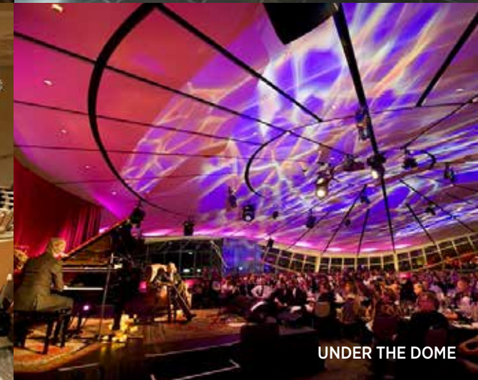
UNDER THE DOME