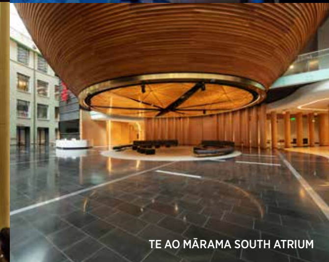
TE AO MĀRAMA SOUTH ATRIUM