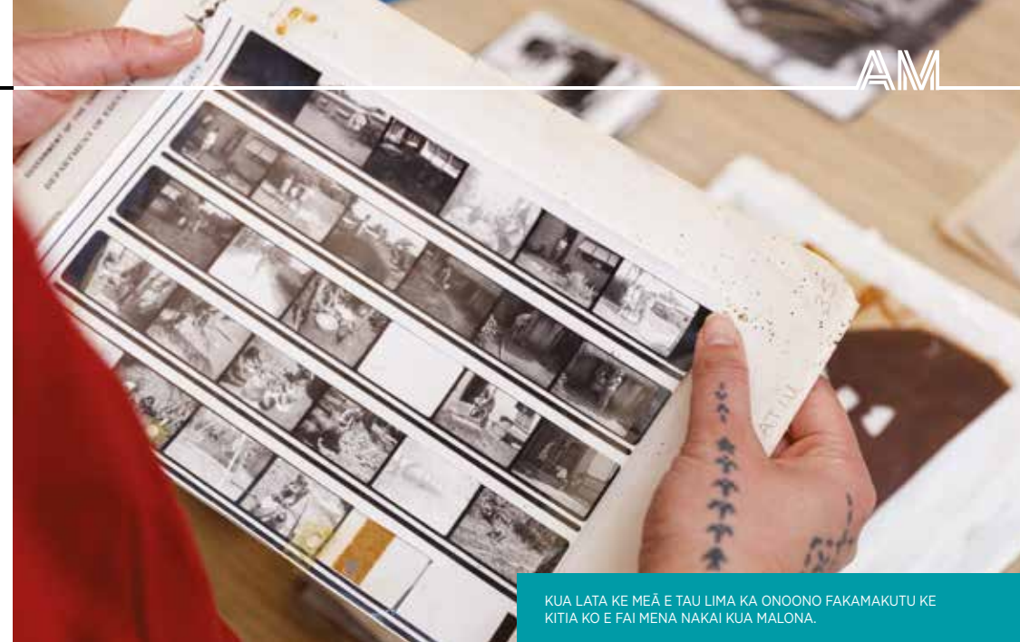
KUA LATA KE MEĀ E TAU LIMA KA ONOONO FAKAMAKUTU KE KITIA KO E FAI MENA NAKAI KUA MALONA.

Tau mena ke taute e koe: Toka he taha poko tokanoa ne nakai vela mo e aafu ke ua mafiti e malona po ke popo. Mitaki ka pehē hahau fakatote e poko ne toka ai e tau koloa ia. Ua toka he tau poko ne maeke ai e tau vevela mo e momoko ke lahi e hihikihiaga tuga e tau poko i lalo he fale, poko kōkou, poko kaitunu, poko i luga he alo fale mo e fale toka motokā. Ua fakatata atu ke he fuga simeni, fakamamao mai mo e tau lakau fakamafana he fale mo e tau kaupā. Fakaaoga e lakau hila (dehumidifier) ke uta kehe e tau haumia he liu fale, ka e pā e tau pū hio po ke hafagi e tau pū hio ka e fakaaoga e lakau hila fakahauhau (fan). Fakaaoga falu a koloa ke uta kehe e tau haumia po ke fakatau e taha koloa tuga e hygrometer ke fuafua e tūaga he aafu ke he kaina.