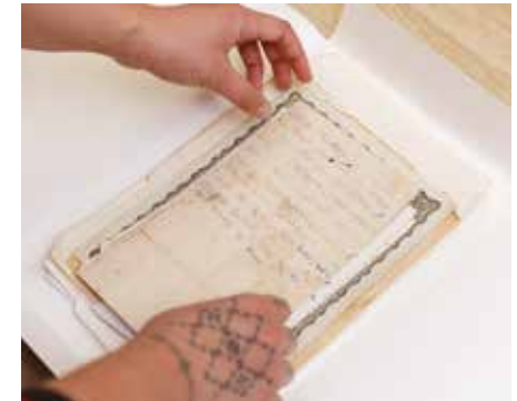
POTA FAKALATAHA E TAU KOLOA KUA FAI TATAIAGA.