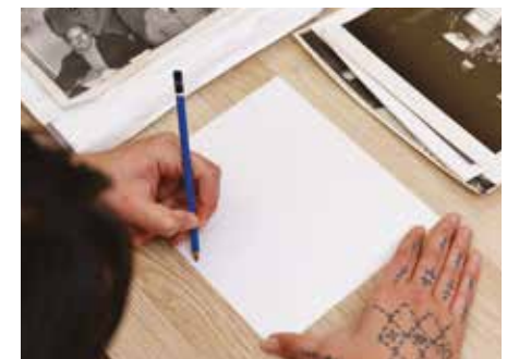
FAKAMAU HIFO E TAU MENA MAHUIGA (TAU HIGOA, TAU MATAKAVI, TAU AHO) KI TUA HE TAU KOLOA TUGA E TAU ATA MO E FALU A TAU PEPA MAHUIGA.