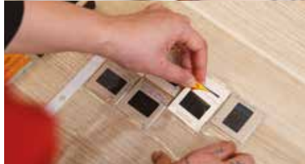
TOTŌ FAKATEKITEKI HE TAU MATAPOTU HE TAU ATA.