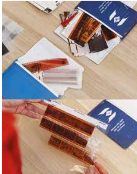
MITAKI E TAU PUHA PALASITIKI KE TOKA AI E TAU KOLOA TUGA E TAU ATA.