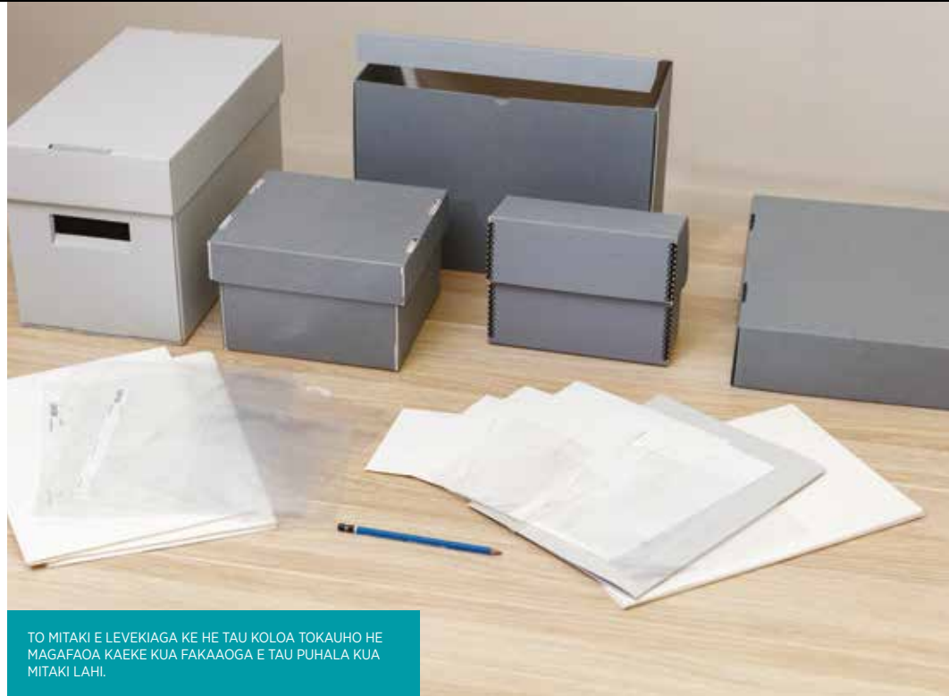
TO MITAKI E LEVEKIAGA KE HE TAU KOLOA TOKAUHO HE MAGAFAOA KAEKE KUA FAKAAOGA E TAU PUHALA KUA MITAKI LAHI.