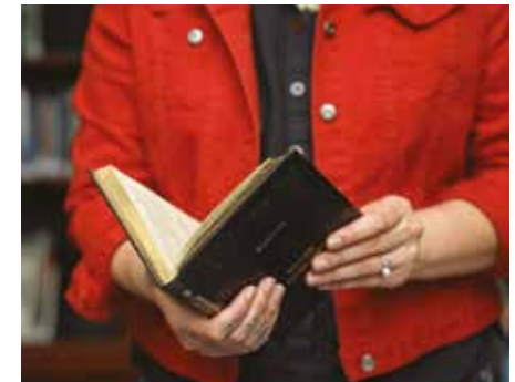
HAFAGI E TAU PEPA NE KITIA KI AI KUA MUKAMUKA KE MALONA KE HE 90°-120° E ANGLE.