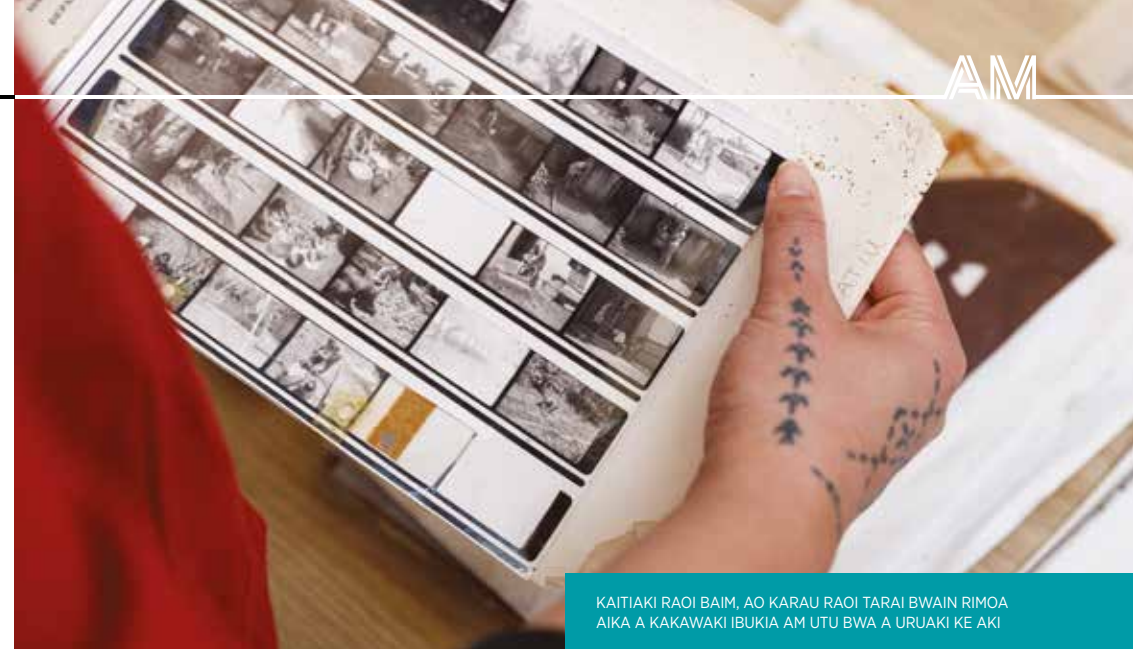
KAITIAKI RAOI BAIM, AO KARAU RAOI TARAI BWAIN RIMO A AIKA A KAKAWAKI IBUKIA AM UTU BWA A URUAKI KE AKI

Ngkana a ikoikotaki i aon bwaai aika kawakinaki (archival items), a kona ni karekea te kinakina i