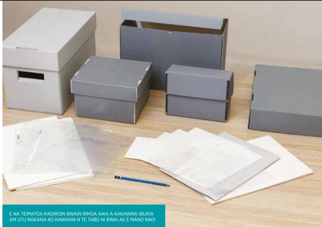
E NA TEIMATOA RAOIROIN BWAIN RIMO'A AIKA A KAKAWAKI IBUKIA AM UTU NGKANA KO KAWAKIN N TE TABO NI BWAI AE E MANO RAOI

te aekaki ni plastic ae e aki rang raoiroi ibukin kawakinan bwaai. Tai kabonganai aekaki n plastic ae iai te PVC iai e ngae ngkana e katereaki i aona bwa e raoiroi ibukin kawakinan bwaai.