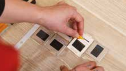
KARAU TAU RAOI TAIAN TAMNEI AIKA SLIDES AO NEGATIVES MAN TARAIA KE RARIKIA