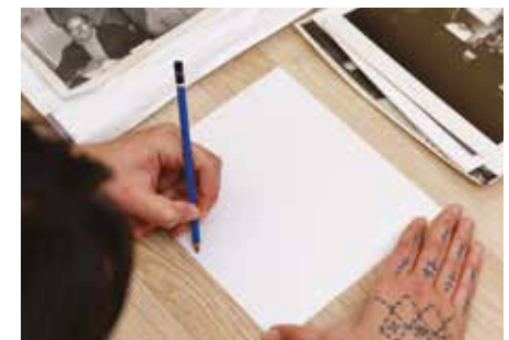
KARAU KOROI RAOI RONGORONGO AIKA A KAKAWAKI (N ARON AARA, TAABO, MA BONGIN NAMWAKAINA) I AKUN TAIAN TAMNEI AO BEEBA AIKA IAI KOROBOKI I AOJA IBUKIA KANOAM N TAAI AIKA A NA ROKO.