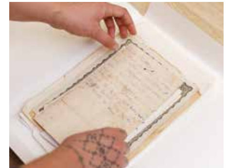
KARAU BOOTI RAOI BWAAI AIKA TI TE AEKAKINA AO KAWAKIN