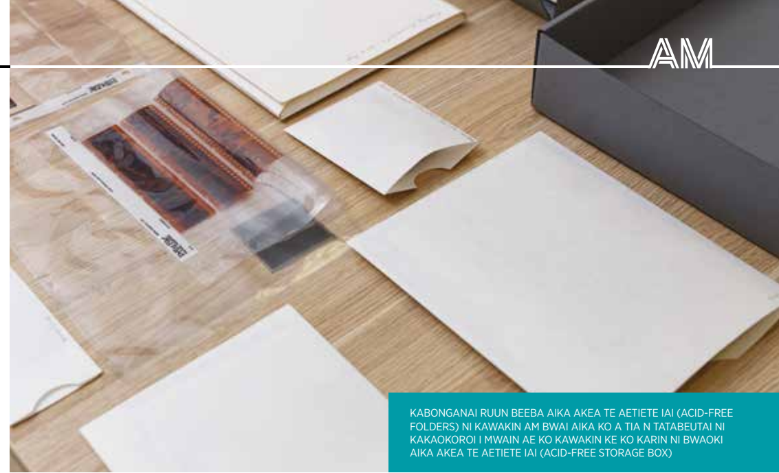
KABONGANAI RUUN BEEBA AIKA AKEA TE AETIETE IAI (ACID-FREE FOLDERS) NI KAWAKIN AM BWAI AIKA KO A TIA N TATABEUTAI NI KAKAOKORO I MWAIN AE KO KAWAKIN KE KO KARIN NI BWAOKI AIKA AKEA TE AETIETE IAI (ACID-FREE STORAGE BOX)

Ngkana iai te boi ae ko arokia ke a kui taian birim, e rang kakawaki bwa ko na kawakin ni kakaokoro i totokoa ana urubwai te acid nakon am bwai ake