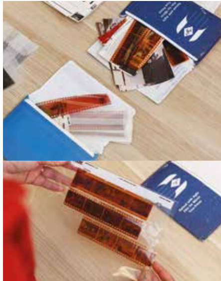
BURAETITIKI (PLASTIC) AIKA IAI RUUIA, A KONA NABA NI KAWAKINAKI IAI TAIAN TAMNEI AIKA SLIDES AO NEGATIVES.